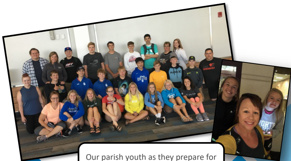
Our parish youth as they prepare for their first leg of travel to Houston.